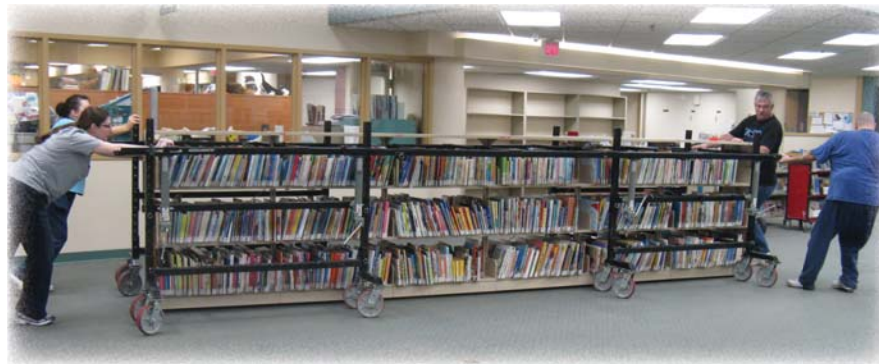
Moving shelves in the Children's Department, January 2009