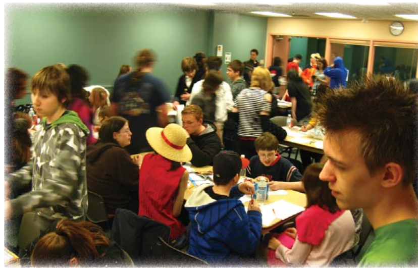
Tic-Tac Anime night, April 2009