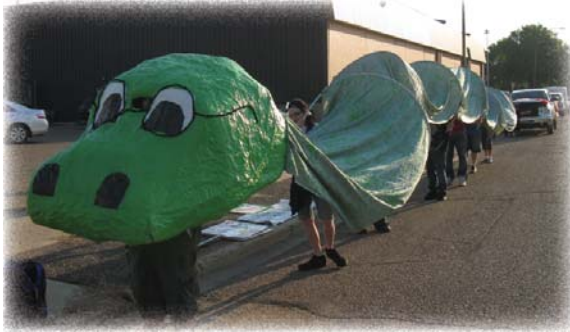
Tic-Tac Bookworm, Medicine Hat Stampede Parade

The Medicine Hat Public Library serves as a community hub, providing equitable and convenient access to books, media, information, and programs that help to educate, enrich, entertain, and inform.